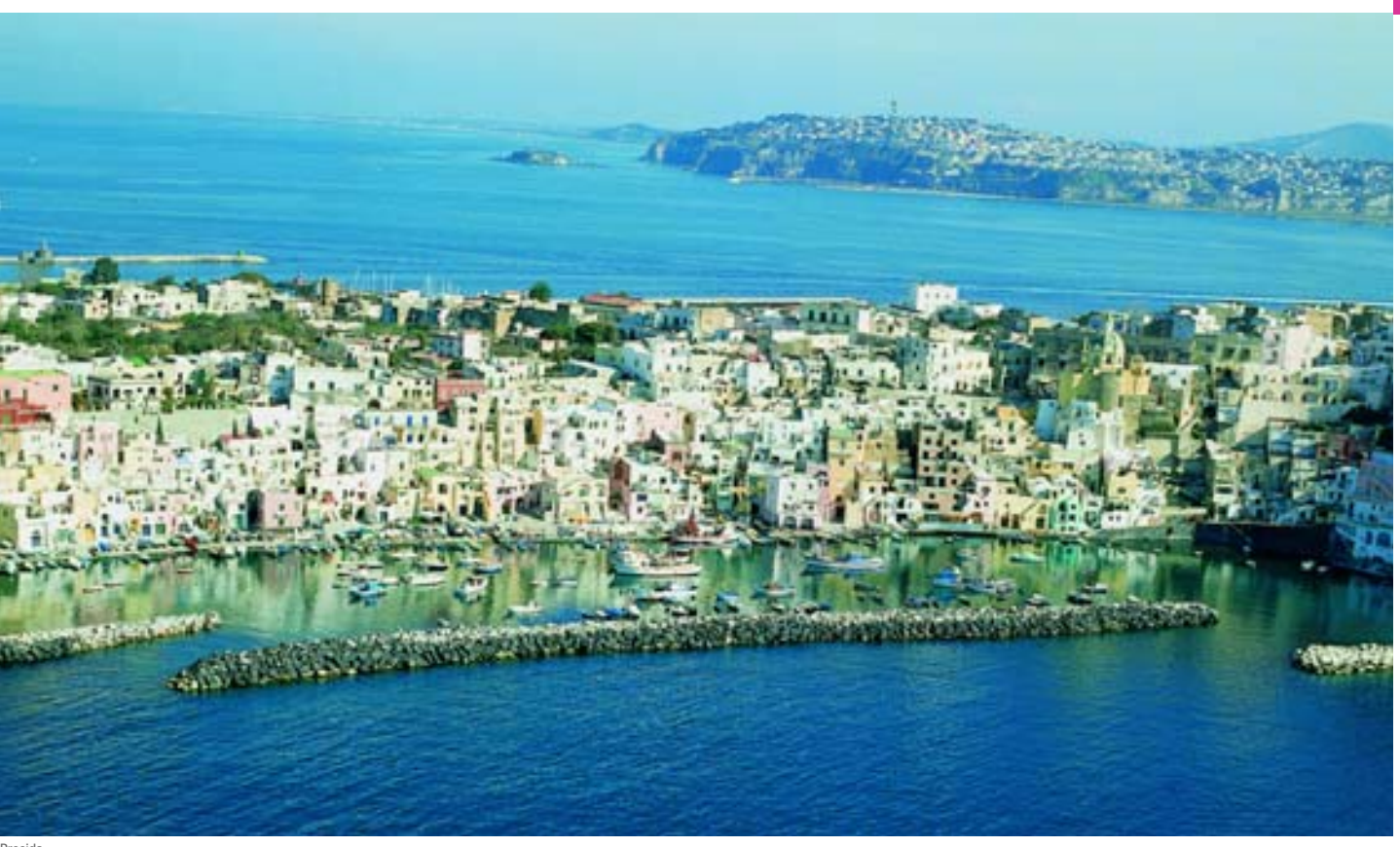
Procida. Marina della Corricella

The favourite place for bathers is the Marina di Chiaiolella , a lovely semicircular inlet closed by the old Santa Margherita promontory. The waterfront is the preferred promenade of the island. Separated from the Chiaiolella by a narrow strip of sea is the Procida lido , a busy bathing establishment. A long bridge unites la Chiaiolella with the islet of Vivara , an oasis protected by the WWF. Permission from the City of Procida is required to visit it.